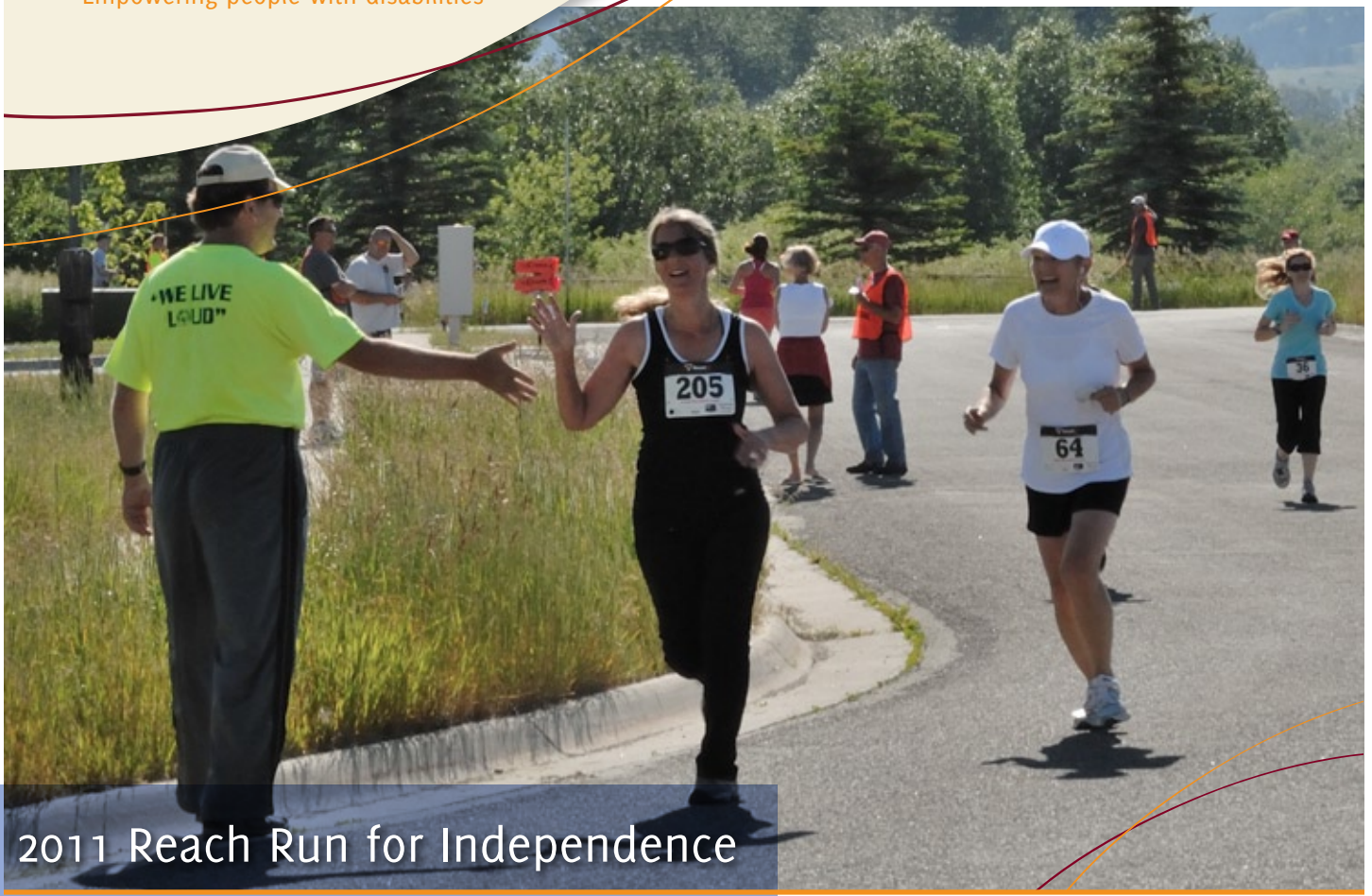
Mitch D. greeting runners near the finish line